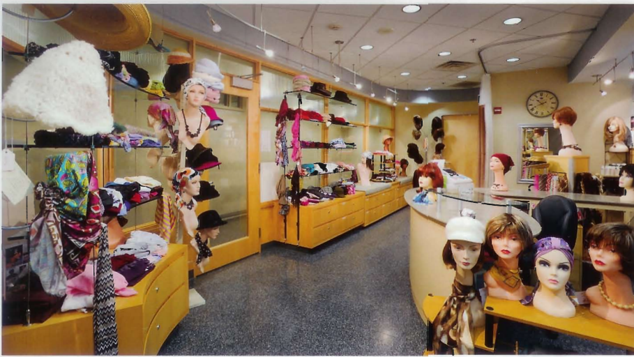
Hair Enhancements of Pittsburgh at LHAS Positive Image Salon in Hillman Cancer Center