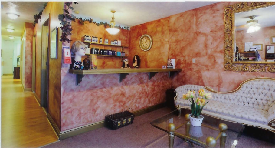
Hair Enhancements of Pittsburgh at South Hills Salon